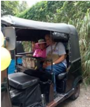
Sri Lanka Tuk Tuk Adventure!